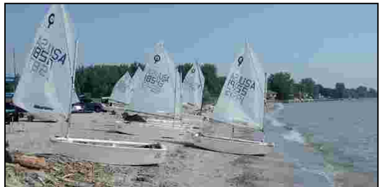
The Optis are ready to go on the beach at North Cape Yacht Club.